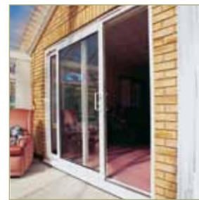
Ideal for rooms leading into a conservatory