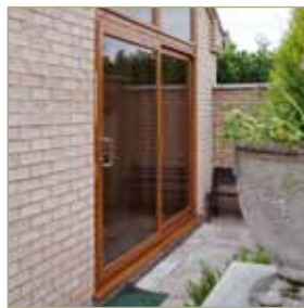
Patio doors are perfect for leading into your garden space

Available in a range of colours such as classic cream or traditional timber appearance, you can select a different interior colour to blend with your interior décor.