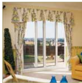
Patio doors increase natural light into your room