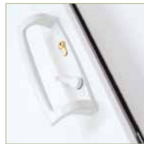
Available in a range of stylish handle options