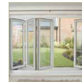
Our bi-fold doors are manufactured with a slim, square edge door profile, to achieve attractive looks and maximum glass area